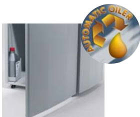
“AUTOMATIC OILER” Special automatic integrated oiling system. Automatically lubricates cutting knives during the shredding operation