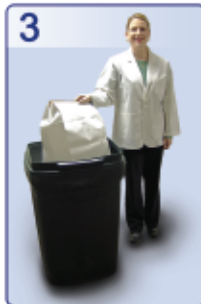
3 Discard full bag of shredded material.