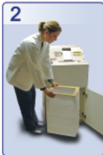
2 Remove Self-Sealing Bag when full.