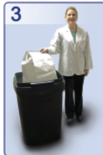
3 Discard full bag of shredded material.