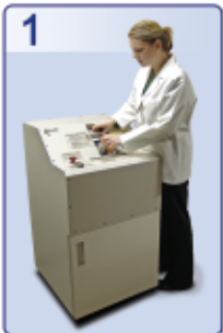
1 Place pill bottles and labels into Shredder.